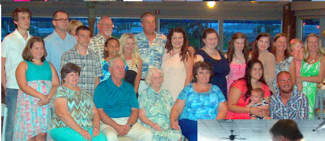
The Nutting Family