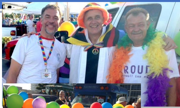
Pride Day June 27