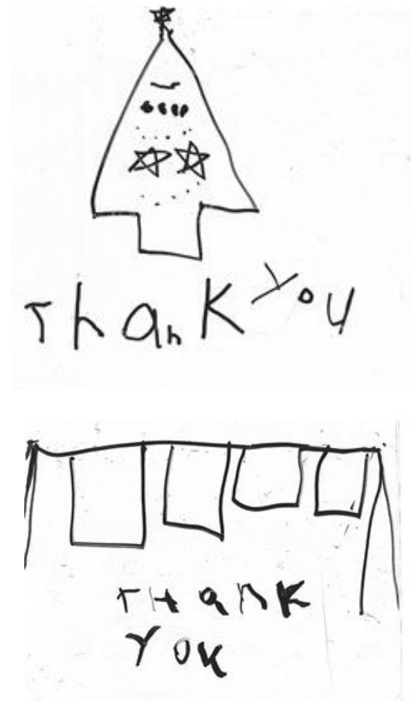
Faith Preschool's VPK Class